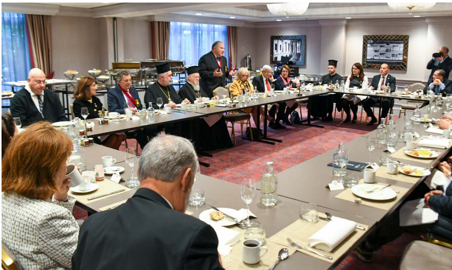
With the blessings of His Eminence Archbishop Elpidophoros of America, an Archdiocesan delegation accompanied His All-Holiness Ecumenical Patriarch Bartholomew to Brussels, Belgium from November 9 to 11, 2019 on the occasion of the 50th Anniversary/Golden Jubilee of the Orthodox Archdiocese of Belgium.