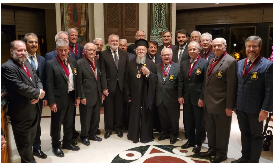
His Eminence Archbishop Elpidophoros of America from November 17 to 23, 2019 led an Archon Pilgrimage to Constantinople to receive the blessings of His All-Holiness Ecumenical Patriarch Bartholomew.