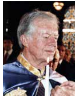
Archon President Jimmy Carter US President