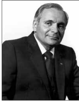
Archon Michael Bilirakis Member of the U.S. House of Representatives