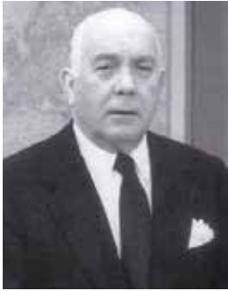
Archon Spyros P. Skouras Motion Picture Pioneer and President of 20th Century Fox

Many notable individuals within the Christian community are Archons.