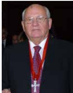
Archon Mikhail Gorbachev Former Soviet Union Leader