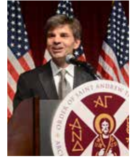
Archon George Stephanopoulos Former White House Communications Director and News Anchor, ABC