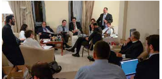
The advance team and support staff hold a late-night meeting to discuss the day's events and plan for the next morning.