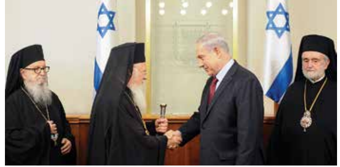
His All-Holiness meets with Israeli Prime Minister Benjamin Netanyahu.