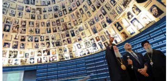
His All-Holiness tours The Hall of Names inside the Yad Vashem Holocaust Memorial Museum.