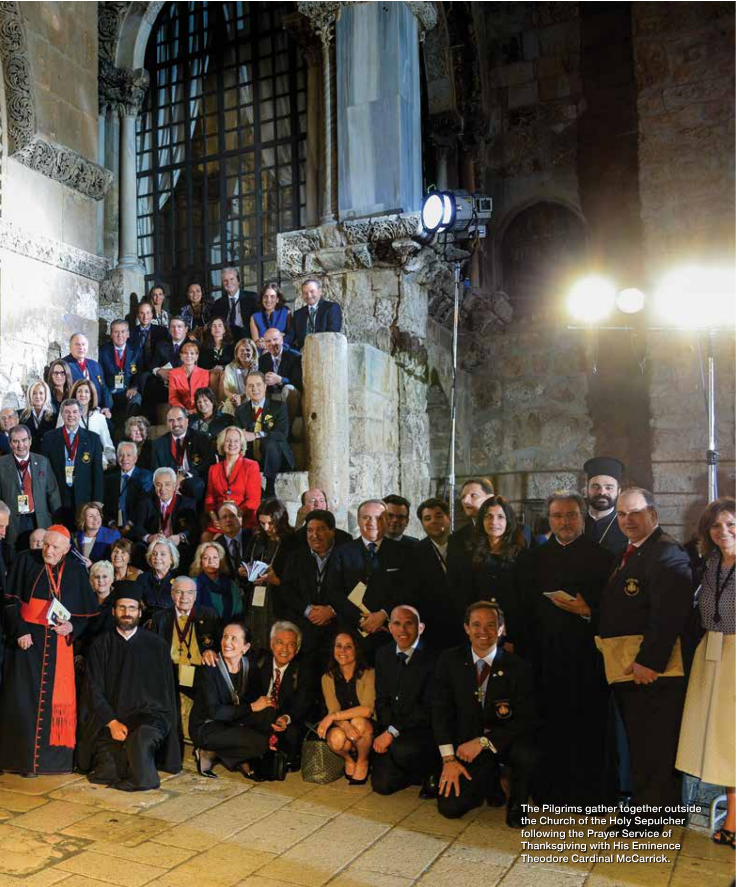
The Pilgrims gather together outside the Church of the Holy Sepulcher following the Prayer Service of Thanksgiving with His Eminence Theodore Cardinal McCarrick.