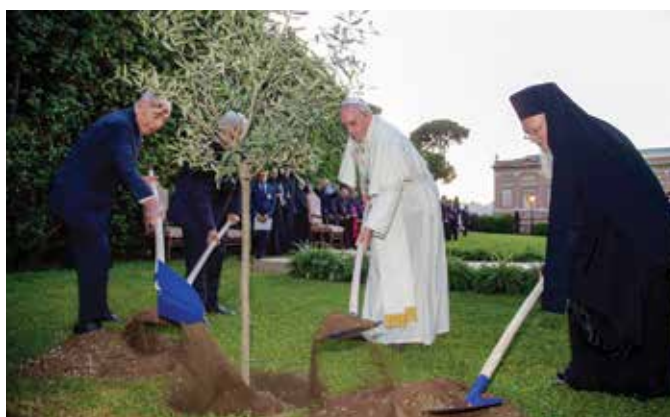
From left, Israel's President Shimon Peres, Ecumenical Patriarch Bartholomew I, Pope Francis, and Palestinian President Mahmoud Abbas pose for photographers at the end of an evening of peace prayers in the Vatican gardens, Sunday, June 8, 2014.

The Ecumenical Patriarch also called upon God's blessings upon the Jewish, Christian and Muslim children of the Holy Land and prayed that their shared thanksgiving for all of God's blessings may remind them that they are brothers and sisters.