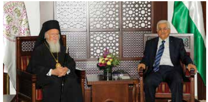
His All-Holiness meets with Palestinian President Mahmoud Abbas in Ramallah.