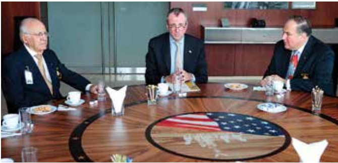
Delegation with U.S. Ambassador to Germany Philip Murphy.