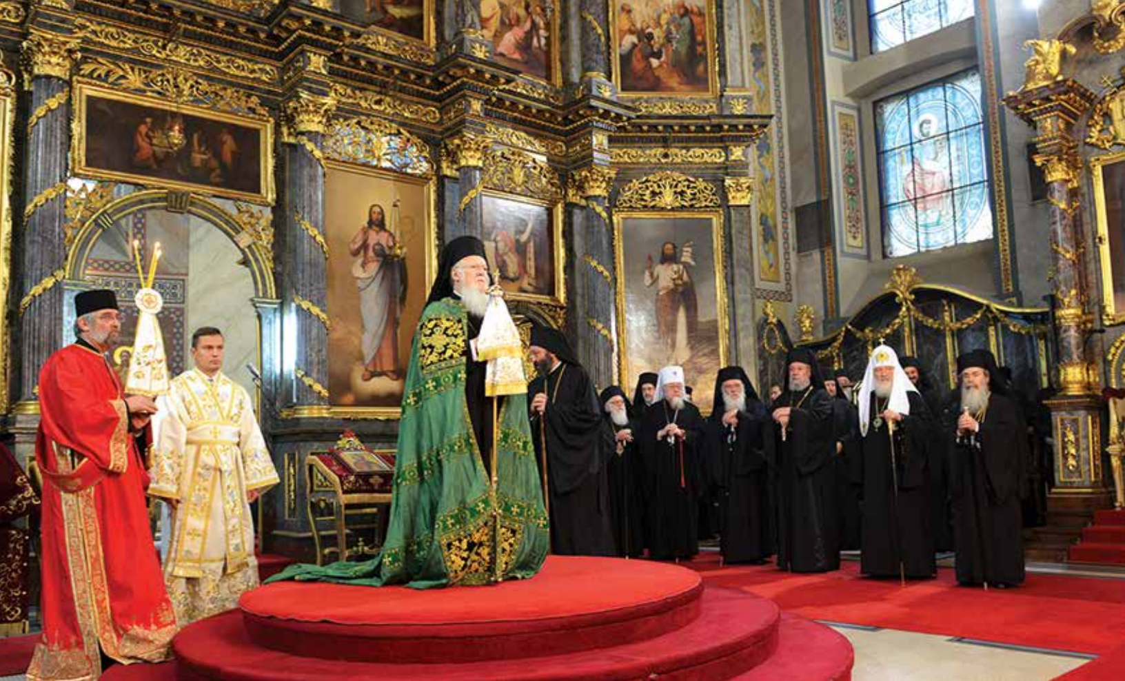
The Ecumenical Patriarch presides before other Heads of Churches at the Cathedral of the Archangel Michael on October 5, 2013 in Belgrade, Serbia for celebrations marking the 1700th anniversary of Emperor Constantine the Great's "Edict of Milan." The celebrations were organized by the Orthodox Patriarchate of Serbia in Niš, the city of St. Constantine's birth.