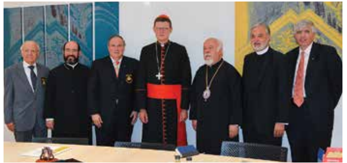
Delegation with Cardinal Rainer Maria Woelki of Berlin.