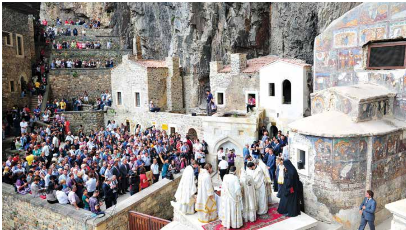
On August 15, 2013, His All-Holiness celebrated the great feast of the Dormition of the Theotokos at the historic monastery of Panaghia Soumela. This is the fourth consecutive year that His All-Holiness has led an annual pilgrimage to the historical monastery since its closure nine decades ago. The monastery was founded in 386 and functioned without interruption until 1923.

the Archon Washington Initiative . Their ongoing efforts to keep the issue of the religious freedom of the Ecumenical Patriarchate high on the agenda of our government leaders are intensive and laborious. There are many new officials serving the White House, State Department and Congress who formulate policy towards Turkey who are not familiar with the religious freedom deficit that severely constricts the ministry of the Ecumenical Patriarchate. Concentrated efforts in educating members of the House Foreign Affairs Committee and Senate Foreign Relations Committee are underway to ensure the many new committee members are fully aware of the religious freedom crisis in Turkey.