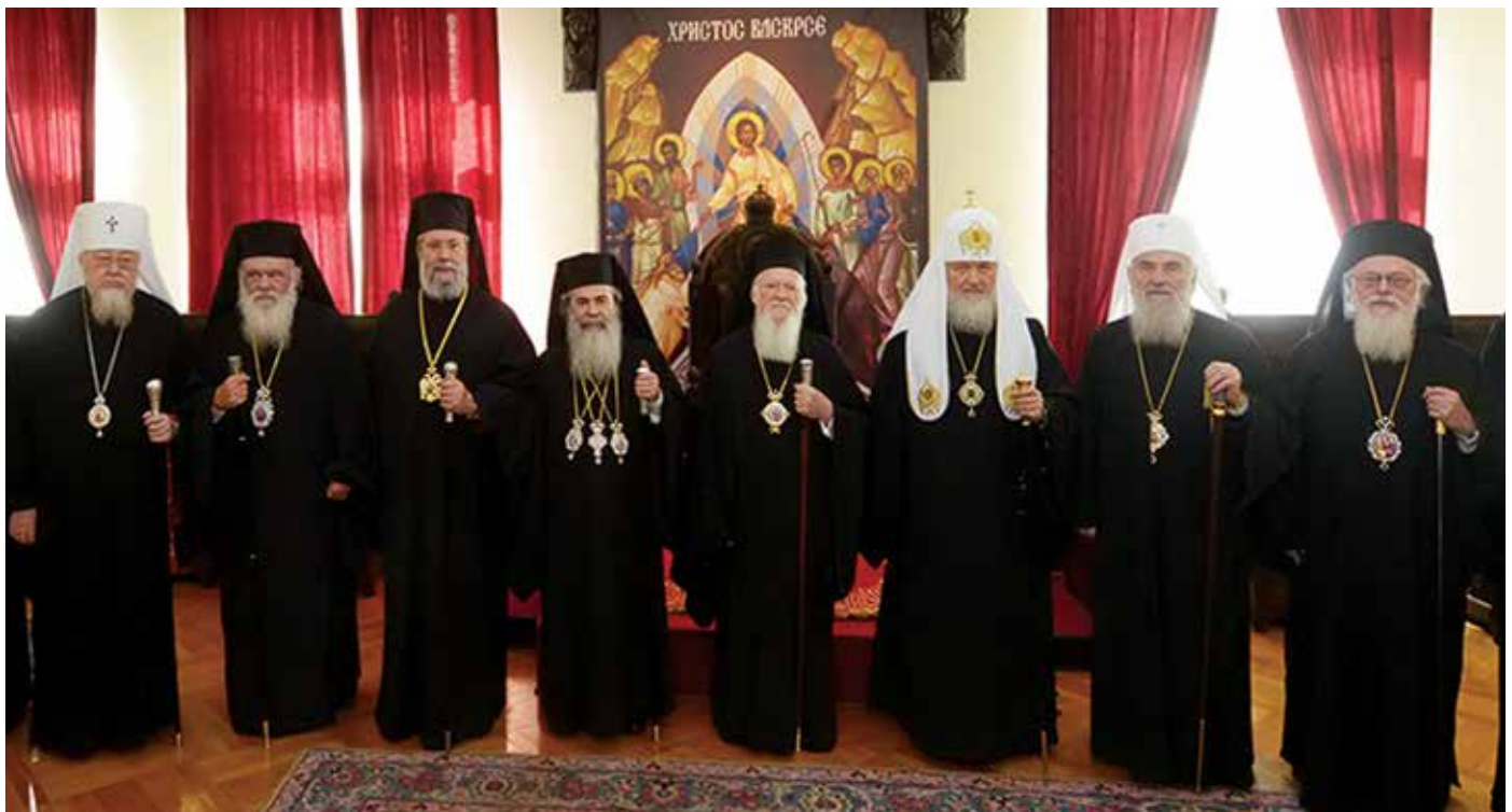
[L-R] Metropolitan Sawa of Poland; Archbishop Ieronymos of Athens; Archbishop Chrysostomos of Cyprus; Patriarch Theophilos of Jerusalem; His All-Holiness Ecumenical Patriarch Bartholomew; Patriarch Kirill of Moscow; Patriarch Irinej of Serbia; and Archbishop Anastasios of Albania.