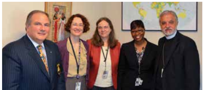
The delegation at the offices of the U.S. Ambassador-at-Large for International Religious Freedom.