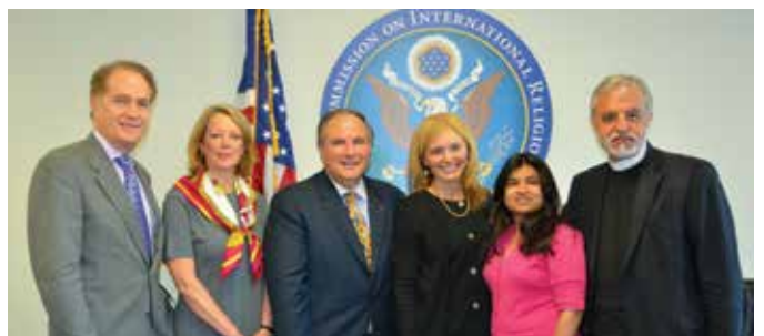
The delegation at the offices of the U.S. Commission on International Religious Freedom.