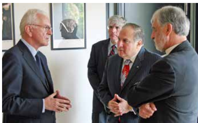
Delegation with Dr. Hans-Gert Pottering MEP, Honorary Professor and President of the European Parliament ret., Chairman of the Konrad-Adenauer-Stiftung.

With the blessings of His Eminence Archbishop Demetrios of America, a Religious Freedom Mission Team traveled to Berlin, Germany and Constantinople to finalize plans and logistics for the Archon Second International Conference on Religious Freedom. The purpose was to further religious freedom advocacy with Turkish government officials and pay respects to His All-Holiness Ecumenical Patriarch Bartholomew and to receive his blessings regarding the Conference and other Archon activities.