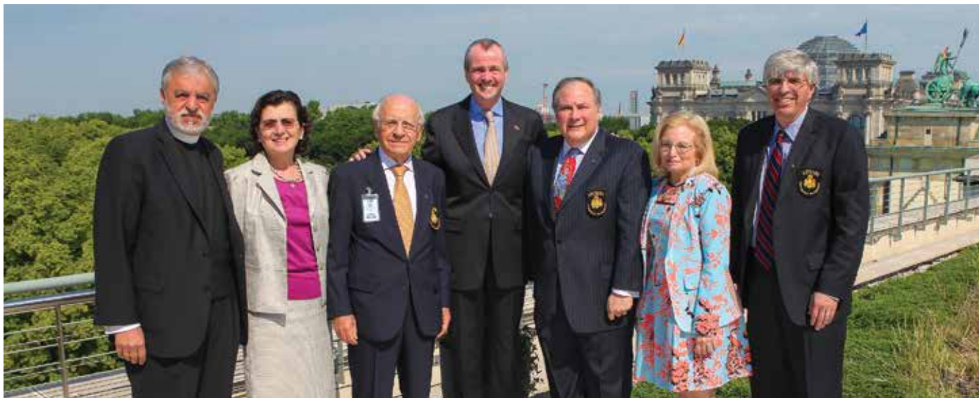
On June 18, 2013, a Religious Freedom Mission Team traveled to Berlin, Germany and met with U.S. Ambassador Philip D. Murphy at the U.S. Embassy. Extensive and productive meetings were held with the U.S. Ambassador, along with other religious, diplomatic and government leaders during their visit, in preparation for the Archon Second International Conference on Religious Freedom.