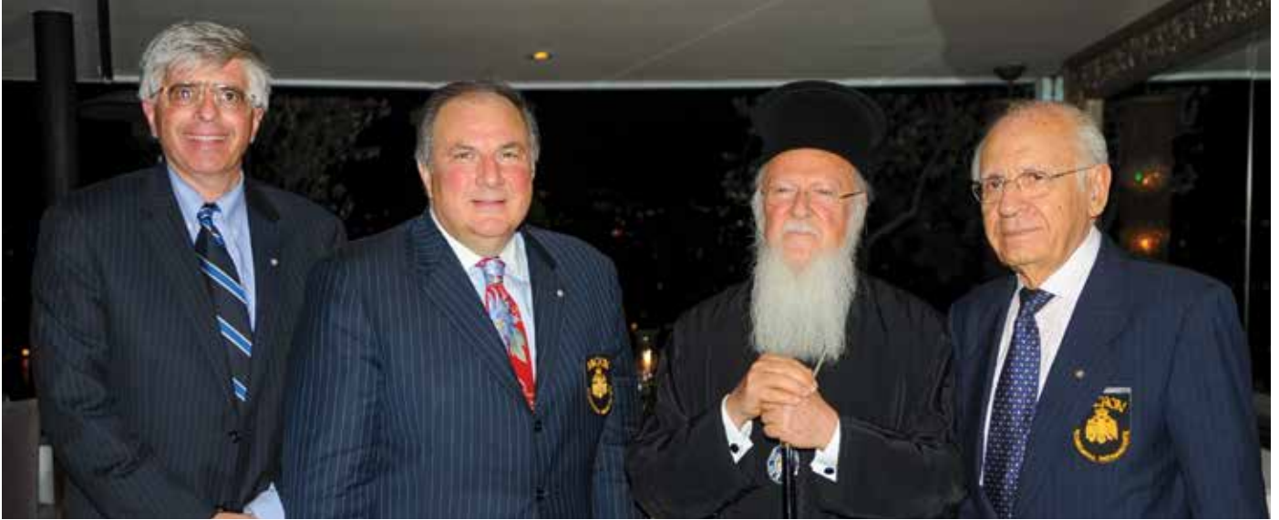
Delegation with His All-Holiness in Istanbul.