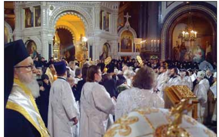
Archbishop Demetrios of America prays inside Christ the Savior Cathedral.