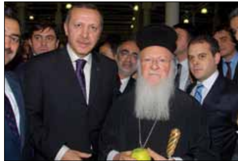
Turkish Prime Minister Recep Tayyip Erdogan shares an apple with ministers, diplomats, and with His All Holiness during a dinner reception which marked the month of fasting for the Alevites.