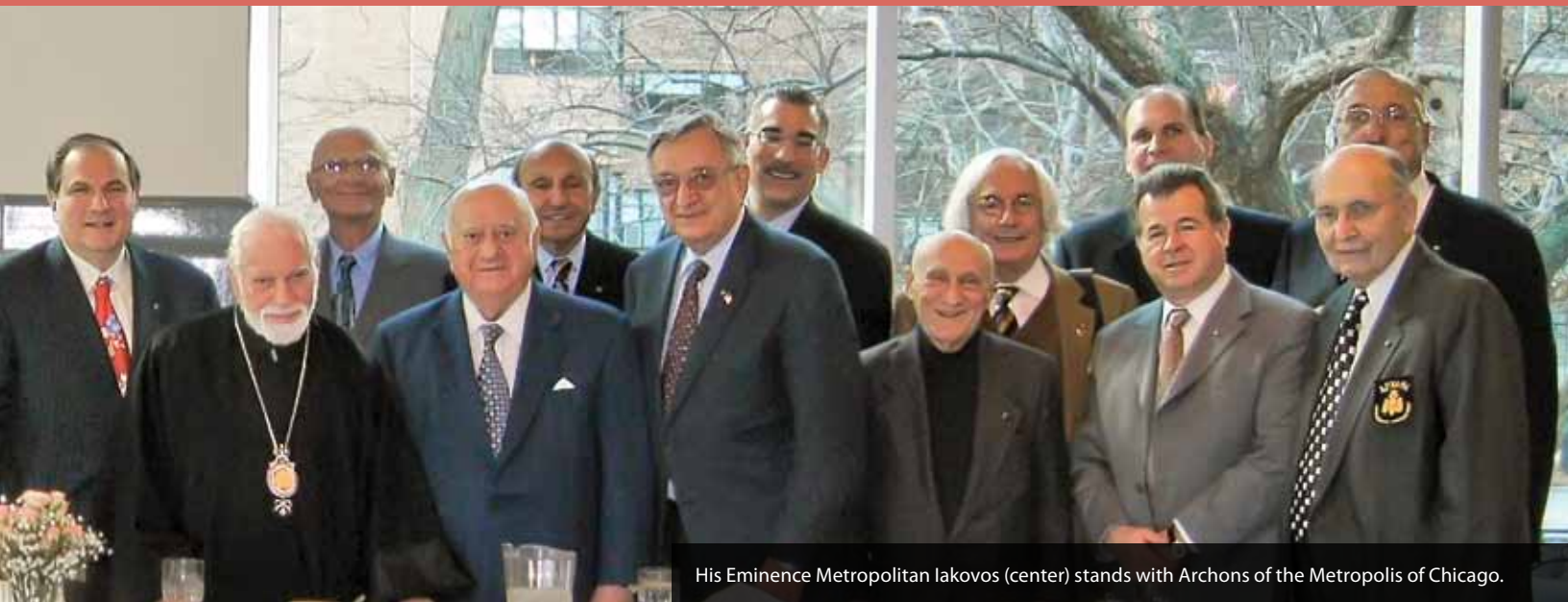
His Eminence Metropolitan Iakovos (center) stands with Archons of the Metropolis of Chicago.