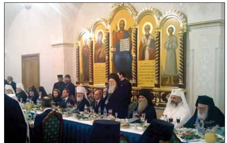
The Ecumenical Patriarch addresses the hierarchs, clergy, and dignitaries at a reception following the funeral. Russian Prime Minister Vladimir Putin and President Dmitry Medvedev are seated at the head table with His All Holiness.