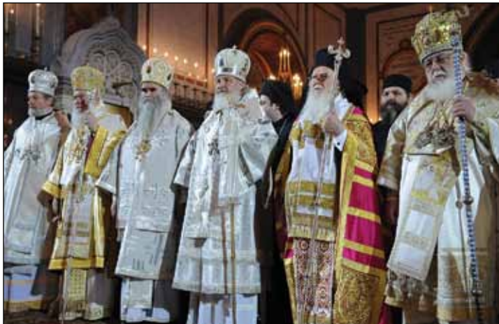
His All Holiness presides over the funeral service beside Orthodox representatives from around the world.

[Ecumenical Patriarch Bartholomew's address can be read in its entirety on archons.org ]