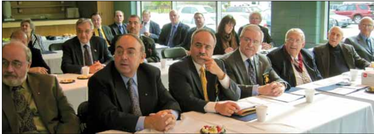
Over 50 participants attended the regional meeting held at St. Andrew Church.