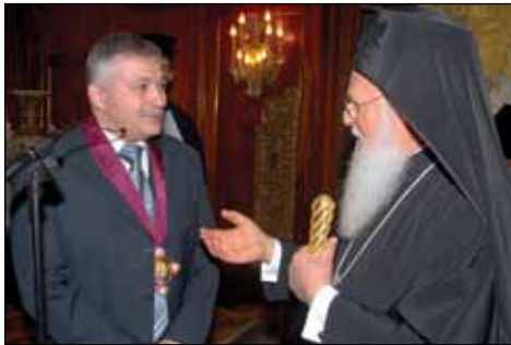
His All Holiness Ecumenical Patriarch Bartholomew honored the Russian Cosmonaut of Greek Heritage, Mr. Theodore Yurchikhin-Gramatikopoulos with the cross of "Panagia Pammakaristos" of the Ecumenical Patriarchate, at the Phanar.