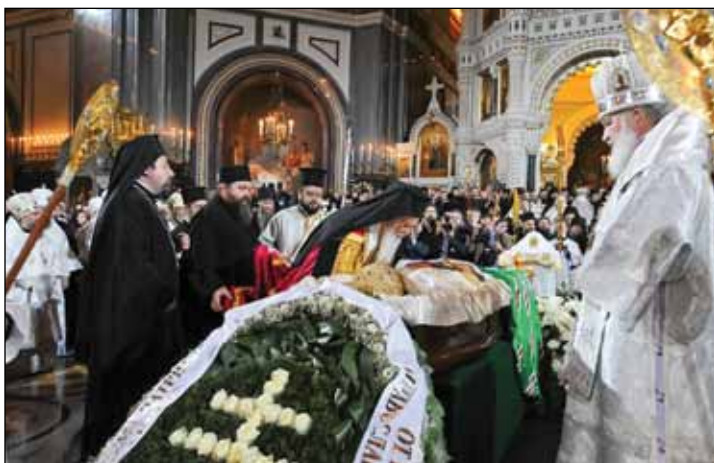
His All Holiness offering the final kiss of peace and farewell.