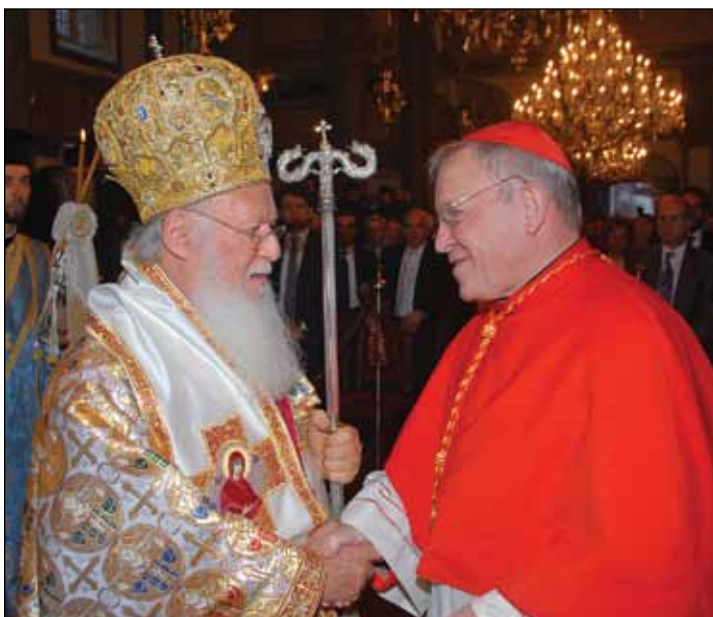
Ecumenical Patriarch Bartholomew welcomes Cardinal Walter Kasper, who represented Pope Benedict XVI, in the Patriarchal Cathedral of St. George for the feast of St. Andrew the Apostle.

In his message, the Pope observed that Ecumenical Patriarch Bartholomew has visited the Vatican three times during this calendar year, most recently to deliver his “most thoughtful address” to the XIIth Ordinary General Assembly of Bishops of the Roman Catholic Church this October, held in the Sistine Chapel. This historic occasion was the first time ever that an Ecumenical Patriarch has addressed this Synod of over 400 Cardinals, Archbishops and Bishops. The Pope also expressed his trust that the relationship between Catholics and