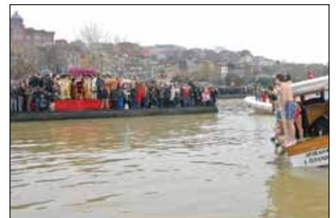
Ecumenical Patriarch Bartholomew celebrated the feast of the Theophany of Our Lord at the Patriarchal Cathedral of St. George in Istanbul, Turkey. Following the celebration of the Divine Liturgy, the Ecumenical Patriarch participated in the traditional blessing of waters and throwing of the cross into the waters of the Golden Horn.