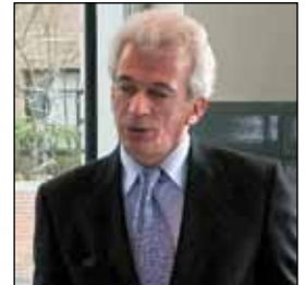
Ambassador Anastasios Petros, Consul General of Greece