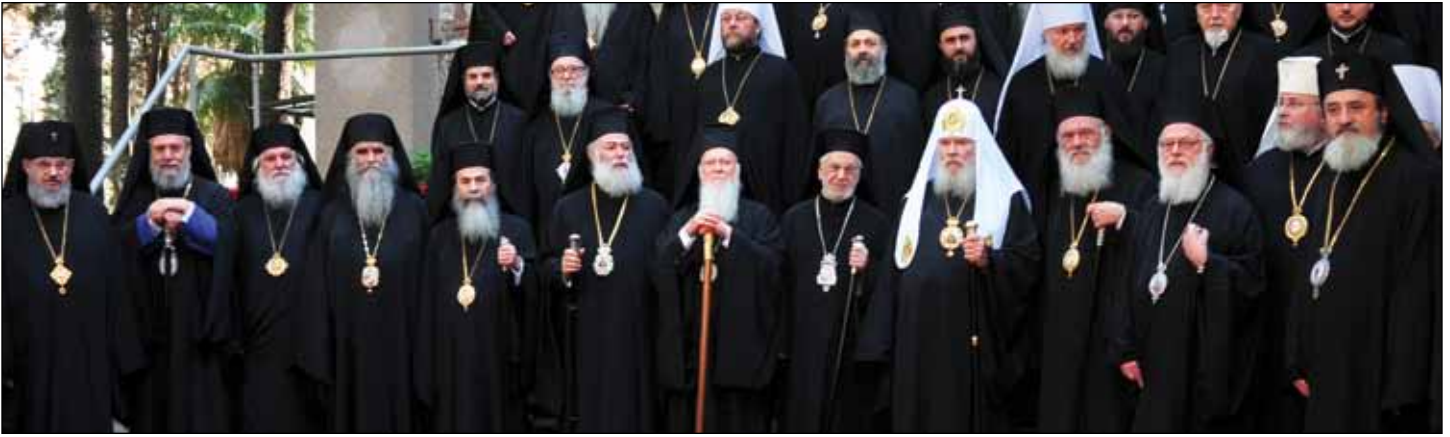
HIS ALL HOLINESS ECUMENICAL PATRIARCH BARTHOLOMEW WITH PATRIARCHS, PRIMATES AND REPRESENTATIVES OF ALL THE PATRIARCHAL AND AUTOCEPHALOUS ORTHODOX CHURCHES AT THE ECUMENICAL PATRIARCHATE, OCTOBER 10-12, 2008.

It is with the greatest respect and humility that we offer the 2008 Annual Report to our beloved spiritual fathers His All Holiness Ecumenical Patriarch Bartholomew and His Eminence Archbishop Demetrios of America, and to the Holy Eparchial Synod in the United States, as well as to our brother Archons of the Great Church of Christ.