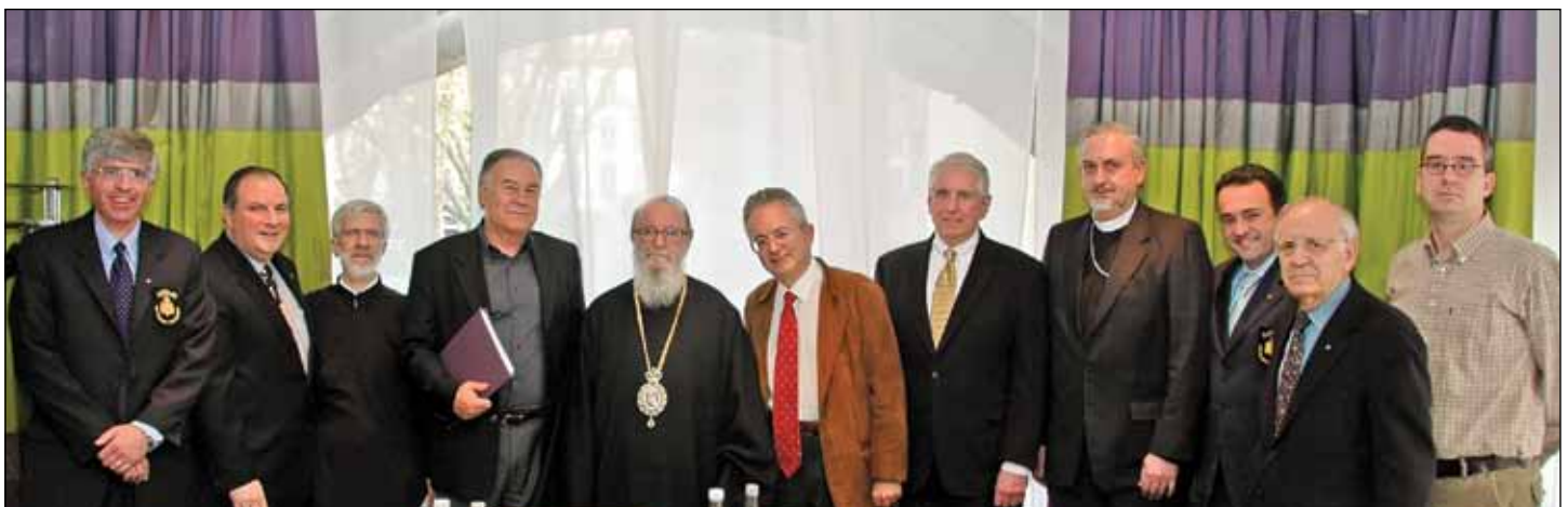
ARCHBISHOP DEMETRIOS OF AMERICA, METROPOLITAN MELITON OF PHILADELPHIA, METROPOLITAN EMMANUEL OF FRANCE, WITH PATRIARCHAL ATTORNEYS AND ARCHON LEGAL COMMITTEE PRIOR TO MEETING.

The basic facts of the case are simple. In 1902, the Ecumenical Patriarchate purchased property on the Island of Buyukada (Prinkipos) off the coast of Istanbul which consisted of land containing two buildings, one five stories and the other two stories. The Ecumenical Patriarchate used the buildings for an orphanage. In 1997, the Foundations General Directorate in effect seized the property without compensation. The Ecumenical Patriarchate unsuccessfully instituted legal proceedings in Turkey to recover the property. It then appealed the decision of the Turkish court to the ECHR. That court reversed the decision of the Turkish court, and in so doing, established a number of basic rights of the Ecumenical Patriarchate. Specifically, the court decision debunked (i.e., rejected as false) the three myths described above.