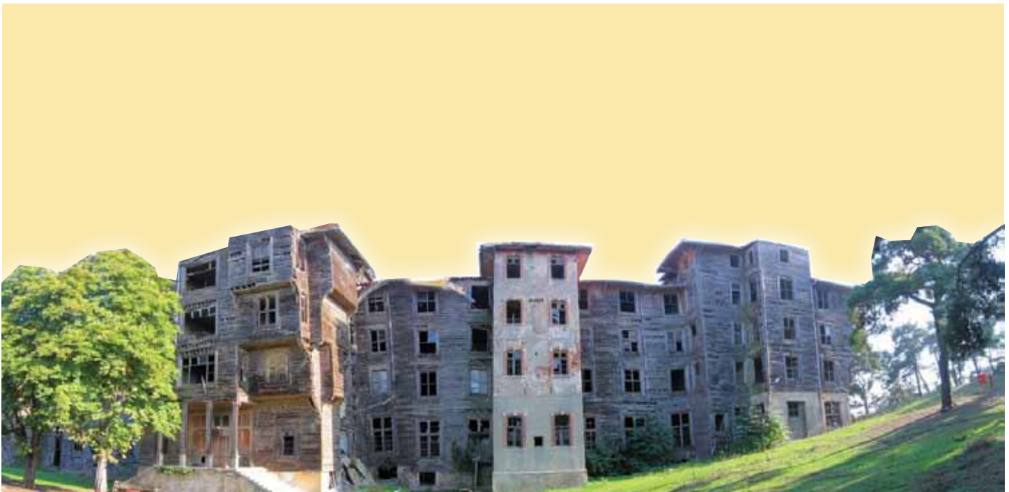
THIS HISTORIC ORPHANAGE IS THE LARGEST SINGLE-STRUCTURE WOODEN BUILDING IN EUROPE AND SECOND LARGEST IN THE WORLD HAVING SERVED AS THE PATRIARCHAL ORPHANAGE UNTIL THE 1960’s.

2 Second, the ECHR referred to the Complainant as the Ecumenical Patriarchate and described it as “an Orthodox Church in Istanbul having an honorary primate and a role of initiative and coordination throughout the Orthodox world.” The Government has long refused to recognize the “Ecumenical” nature of the Ecumenical Patriarchate, including its leading role in the Orthodox Christian Church throughout the world. Instead, it demeans Ecumenical Patriarch Bartholomew by calling him the “Bishop” of only the 2,000 to 3,000 Greek Orthodox Christians in Istanbul. This contention clearly has been rejected by the ECHR.