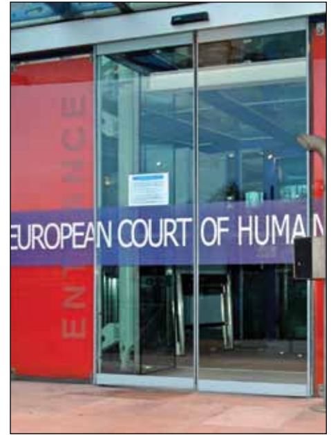
[LEFT] THE PATRIARCHAL ORPHANAGE IS ONE EXAMPLE OF PROPERTY CONFISCATED BY THE TURKISH GOVERNMENT. BECAUSE THE TURKISH GOVERNMENT HAS NOT GRANTED RENOVATION BUILDING PERMITS FOR DECADES, THE ONCE GLORIOUS STRUCTURE, NOW STANDS DEVASTATED ATOP THE BEAUTIFUL ISLAND OF BUYUKADA (PRINKIPOS). [RIGHT] THE SITUATION HAD BEEN TAKEN TO THE EUROPEAN COURT OF HUMAN RIGHTS.

“Ecumenical” nature of the Ecumenical Patriarchate. At least one Turkish court has even said use of the title “Ecumenical” is a criminal offense. Third, the Government has long maintained that the Greek Orthodox minority in Turkey, including the Ecumenical Patriarchate, is not subject to the Treaty of Lausanne. The ECHR’s decision leaves no doubt that these three myths have no basis in law.