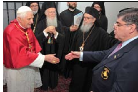
Archon Panicos Papanicolaou receives the Pope's blessing.