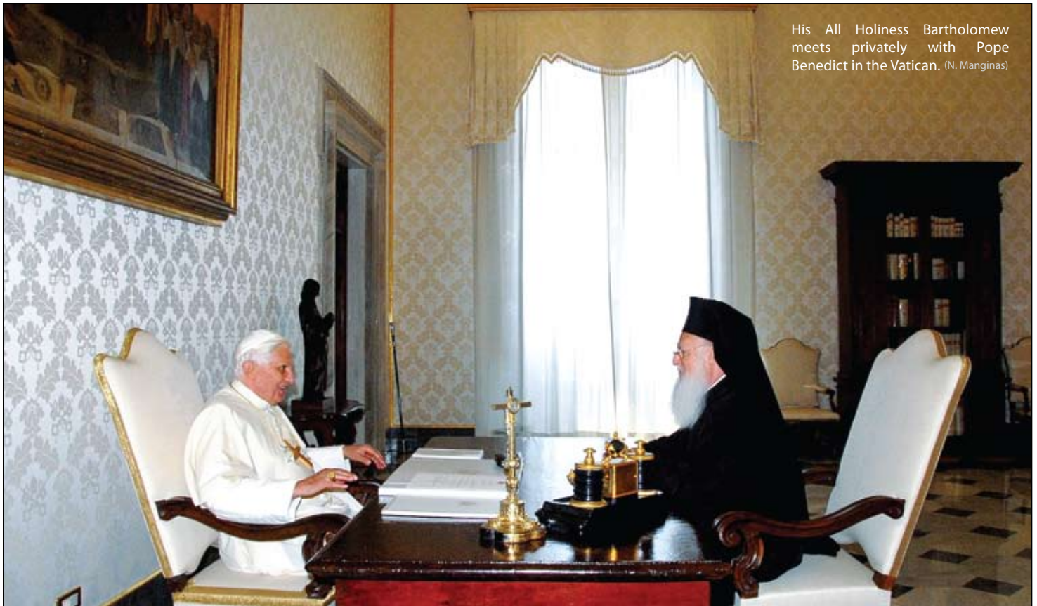
His All Holiness Bartholomew meets privately with Pope Benedict in the Vatican.

“Your Holiness: In attendance at this great and joyous occasion of the Patronal Feast of the Church of Rome are, in addition to ourselves and our Patriarchal entourage, beloved children of the Ecumenical Patriarchate from our Eparchy in the