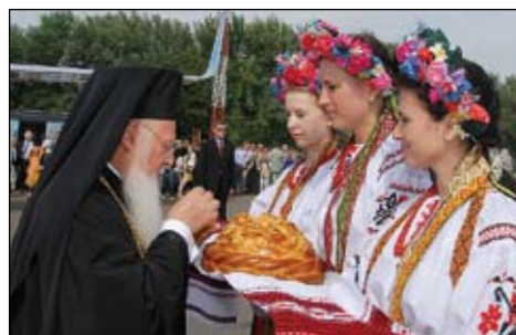
Upon arrival, His All Holiness is greeted by women wearing traditional Ukrainian dress and an offering of bread and salt—a customary welcome of hospitality.