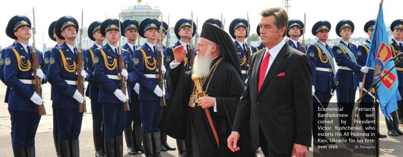
Ecumenical Patriarch Bartholomew is welcomed by President Victor Yushchenko who escorts His All Holiness in Kiev, Ukraine for his first-ever visit.