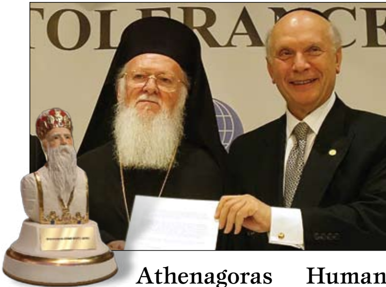
(Appeal of Conscience Foundation)