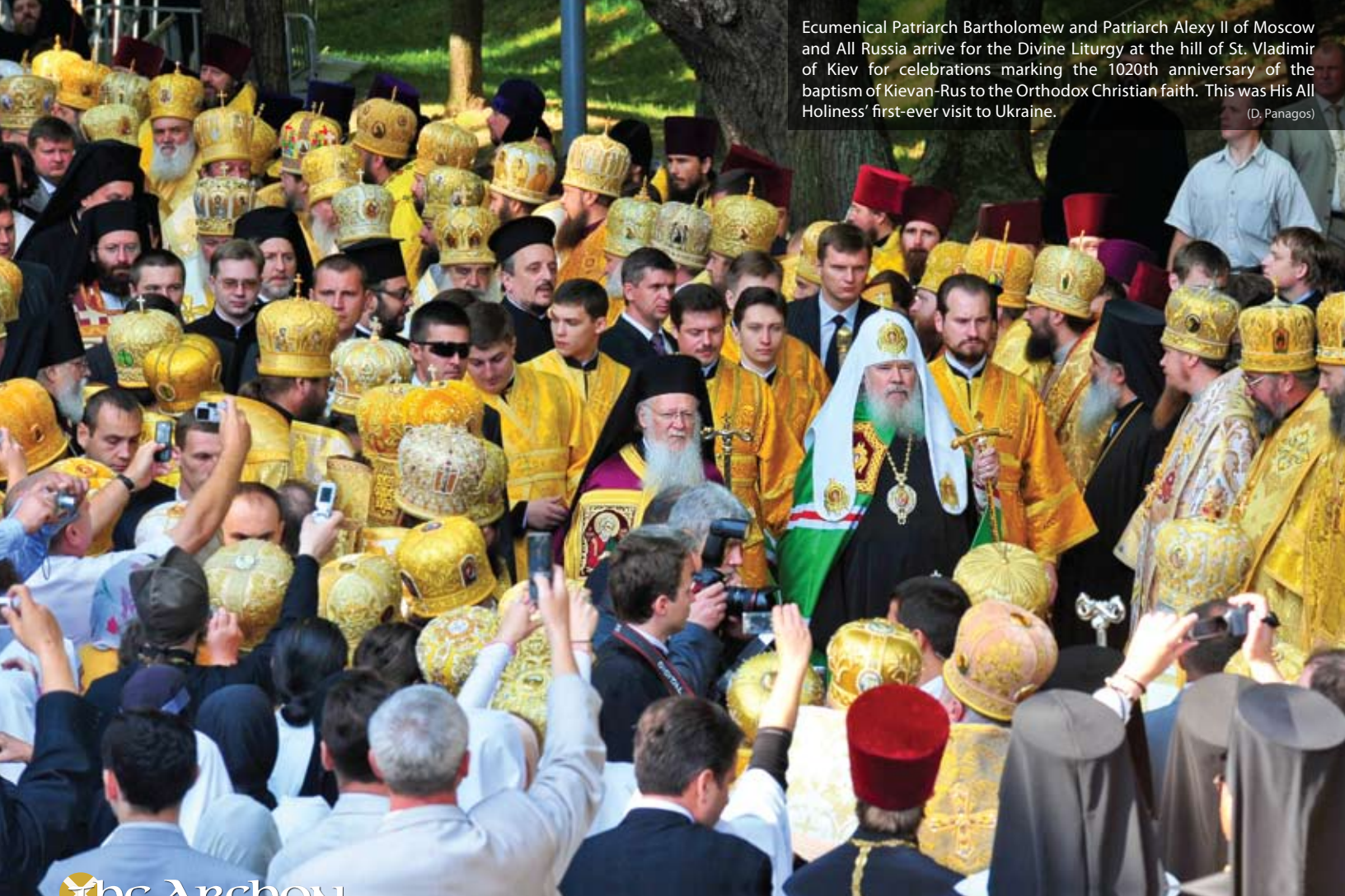
Ecumenical Patriarch Bartholomew and Patriarch Alexy II of Moscow and All Russia arrive for the Divine Liturgy at the hill of St. Vladimir of Kiev for celebrations marking the 1020th anniversary of the baptism of Kievan-Rus to the Orthodox Christian faith. This was His All Holiness' first-ever visit to Ukraine.