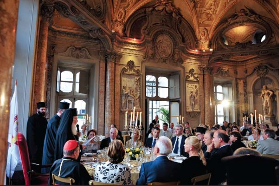
Ecumenical Patriarch Bartholomew addresses Archbishop Demetrios and the members of the Patriarchal delegation at the Palazzo Colonna, Rome, Italy.

Paul Outside the Walls (the tomb of the Apostle Paul), at a Solemn Vespers presided over by the Pope and the Ecumenical Patriarch and at which both Primates spoke. Following the Vespers, as an honor extended to Ecumenical Patriarch Bartholomew, Archbishop Demetrios and the members of the pilgrimage were received at a private audience with the Pope. Ecumenical Patriarch Bartholomew introduced the group of pilgrims to the Pope, saying: