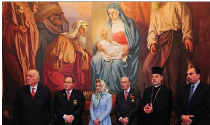
[Top] Members of the delegation with Patriarch Alexy. [Above, top] Archbishop Demetrios presents a set of panagias to Patriarch Alexy. [Above, bottom] Archons celebrate the Divine Liturgy in Christ the Savior Cathedral.