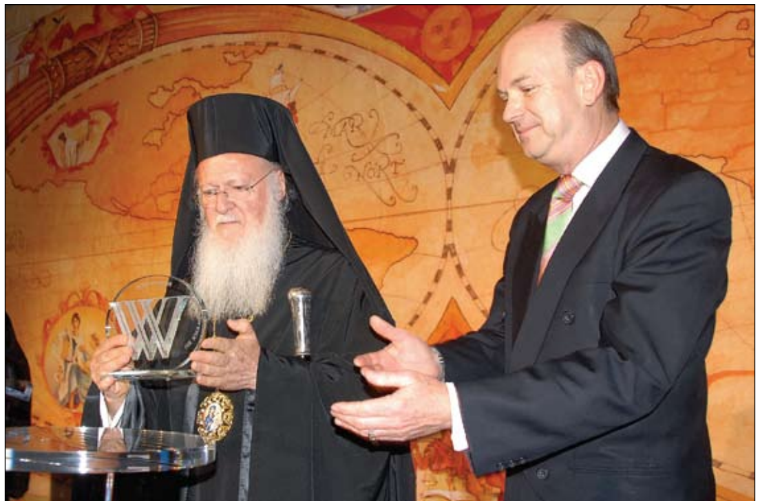
His All Holiness Ecumenical Patriarch Bartholomew is presented with the Woodrow Wilson Award for Public Service for his efforts on environmentalism and human rights.

At the conclusion of his visit, Ecumenical Patriarch Bartholomew met with Prime Minister Costas Karamanlis at the government's headquarters in Athens on Friday, in the presence of Foreign Minister Dora Bakoyannis. ■