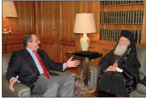
Ecumenical Patriarch Bartholomew meets with the Prime Minister of Greece Costas Karamanlis at the government's headquarters for a discussion during his trip to Athens, Greece.

The U.S. envoy praised Ecumenical Patriarch Bartholomew for his international efforts to promote environmental awareness as well as advancing inter-faith dialogue and the spiritual health of the world's citizens and acknowledged His All Holi-