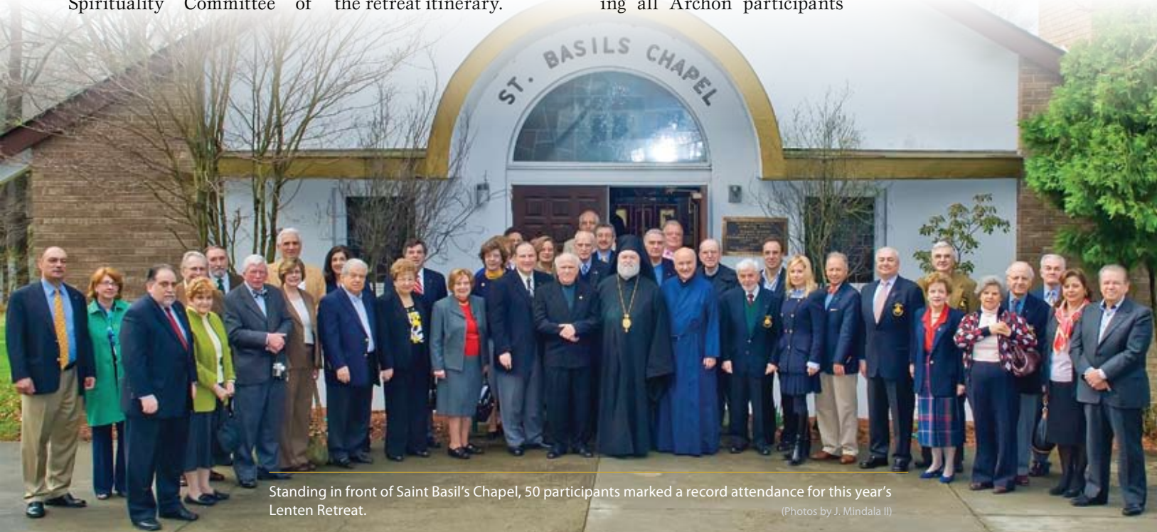
Standing in front of Saint Basil's Chapel, 50 participants marked a record attendance for this year's Lenten Retreat.

Complete coverage is available in the photo gallery on www.archons.org/photo-gallery .