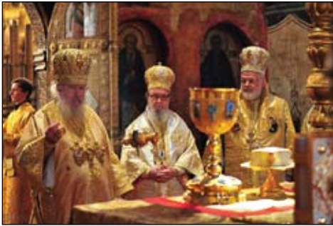
Archbishop Demetrios celebrates Slavic Letters Day with Patriarch Alexy in the 14th century Dormition Cathedral inside the Kremlin in Moscow, Russia.