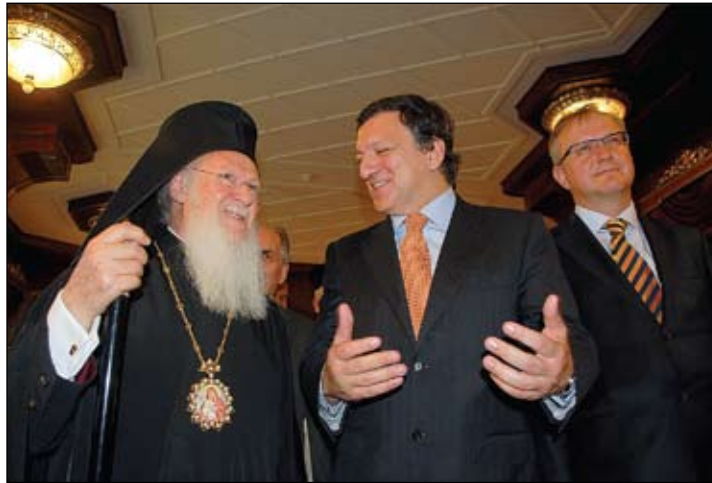
Ecumenical Patriarch Bartholomew welcomes senior EU officials, Jose Manuel Barroso, Commission President, and Olli Rehn, Enlargement Commissioner, to the Phanar.

Read this article on www.iht.com/articles/ap/2008/04/11/