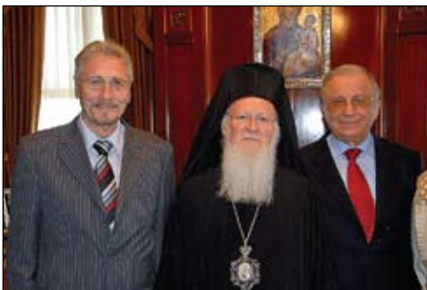
Two former presidents of the Republic of Romania, Ion Iliescu and Emil Constantinescu, met with His All Holiness at the Phanar.