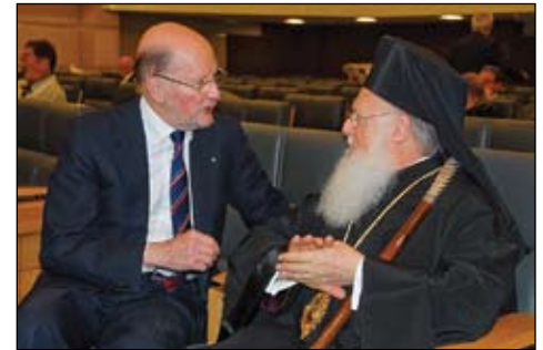
The Ecumenical Patriarch met with the former prime minister of Bulgaria, Simeon Saxe-Coburg, during the 11th Annual Eurasian Economic Summit, which was held at the Chamber of Commerce in Istanbul, Turkey.