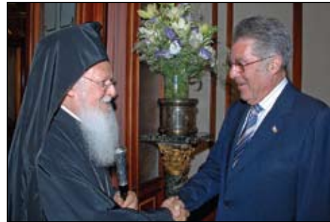
The Federal President of Austria, Heinz Fischer met with His All Holiness at the Phanar.