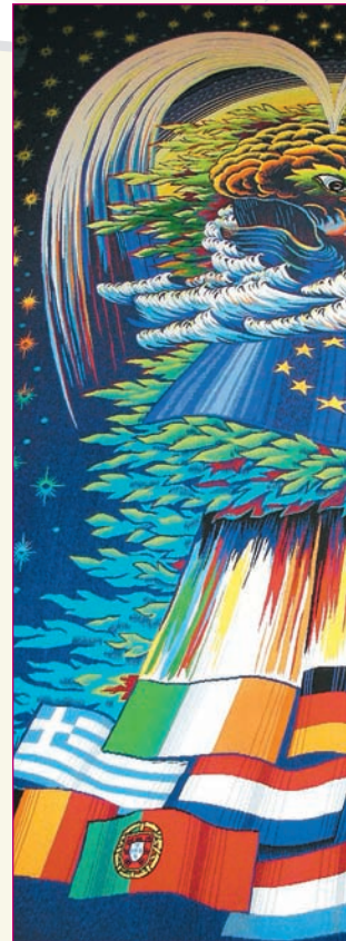
A wall mural depicting the gold stars (each star represents a country) towers over a cluster of flags.