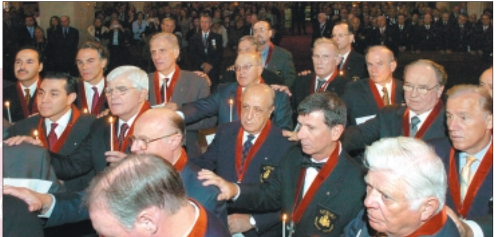
Members of the Archon Class of 2005 as they receive their offikia from Archbishop Demetrios Sunday, Oct. 23.