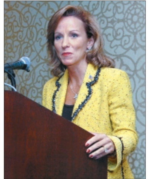
Homeland Security Adviser Frances Fragos Townsend addressed the Ladies Tea.

President Bush's Homeland Security Adviser Frances Fragos Townsend brought a glimpse of the White House to the Order's annual meeting weekend, when she addressed about 100 family members of Archons at the Ladies Tea Saturday afternoon.