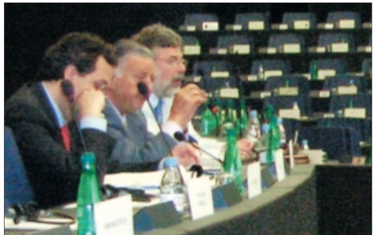
Greek members of the European Parliament from the New Democracy party, from left: Antonios Samaras, Ioannis Varvitsiotis, and George Dimitrakopoulos, held a private session with Archons in the parliament meeting chamber in Strasbourg on May 9.