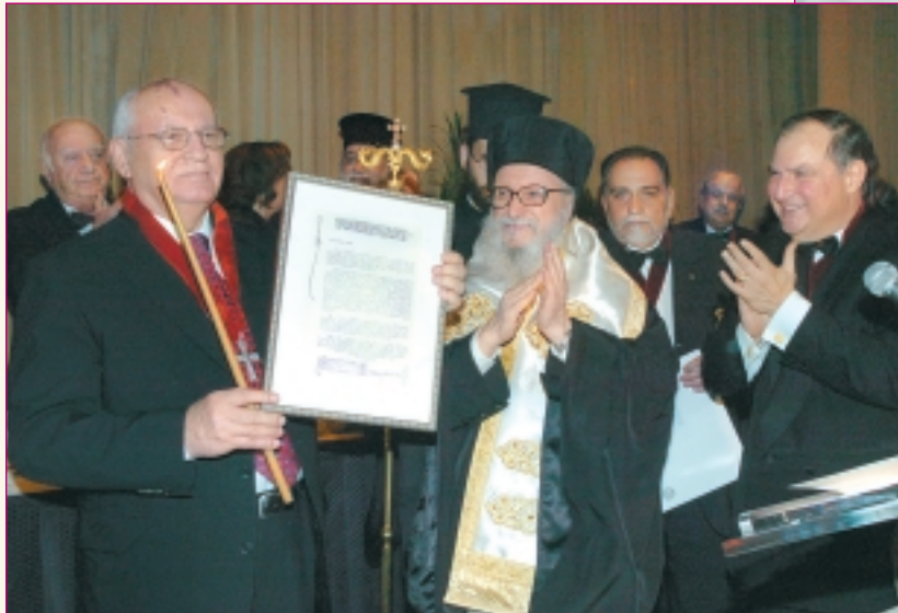
The new invested Archon Great Orator displays the framed letter from Ecumenical Patriarch Bartholomew bestowing the offikion .