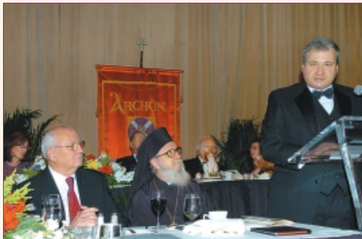
His Excellency Ambassador Andrey Denisov of the Russian Federation called Gorbachev “one of the most eminent statesmen of the 20th century.”