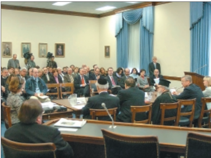
Legislators, cabinet staff, journalists and members of the public packed the room at the Helsinki Commission presentation March 16.