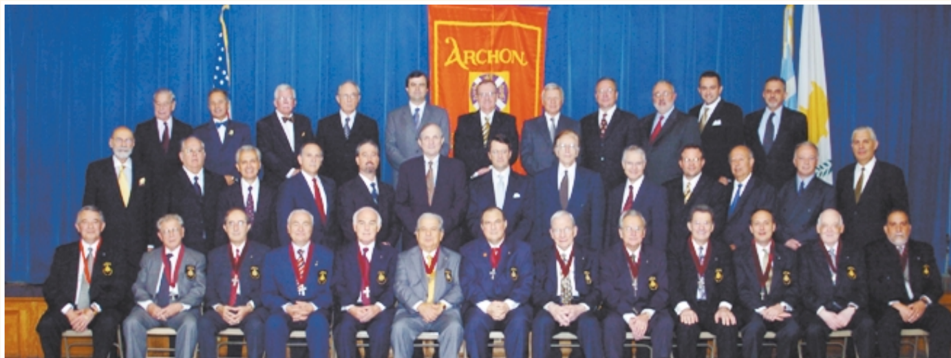
New members of the Order of St. Andrew, Archons of the Ecumenical Patriarchate with the National Council.