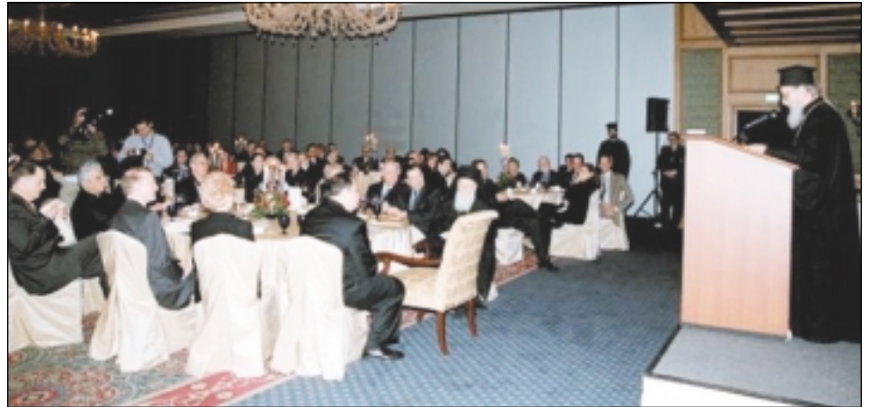
Archbishop Demetrios of America offers an eloquent testimonial in honor of His All Holiness at the Archon banquet.

As Orthodox Christians of America we are most concerned. We are concerned that our School of Theology at Halki was forcibly closed 33 years ago by the government and is still shut, as we witnessed today with our own eyes and saw empty classrooms and dormitories. In a country that prides itself on religious tolerance,