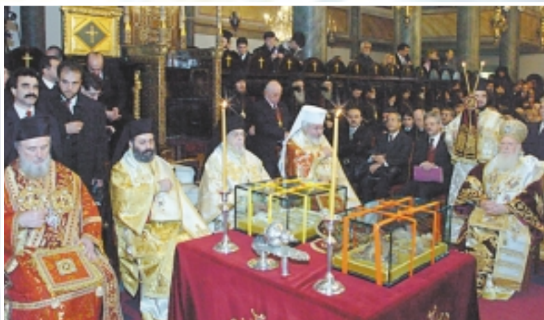
During the doxology, Ecumenical Patriarch Bartholomew (far right) and other hierarchs representing several Orthodox churches surround the table bearing the reliquaries.