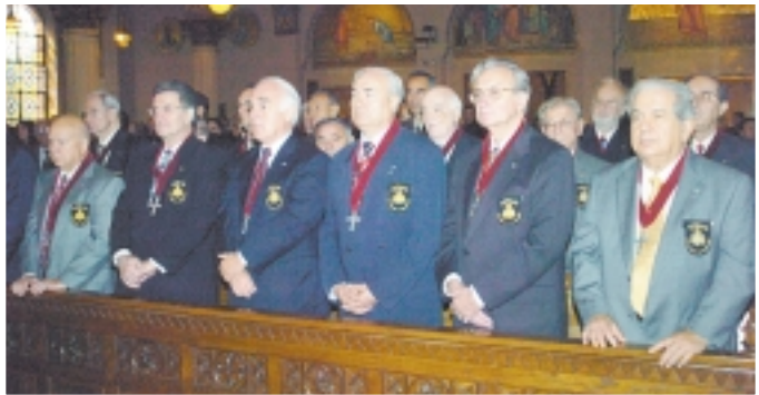
National Council members participate in Sunday liturgy Oct. 10.