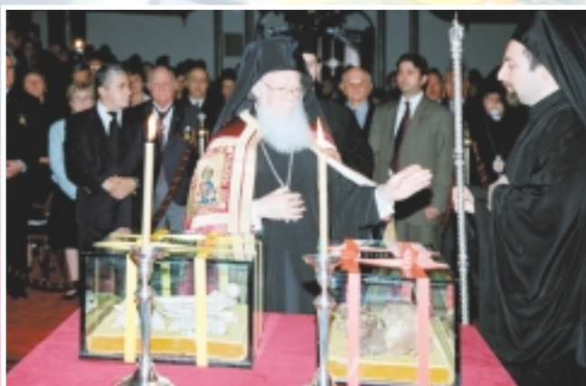
Ecumenical Patriarch Bartholomew presides over the doxology service at the cathedral where the saints' relics were enshrined.