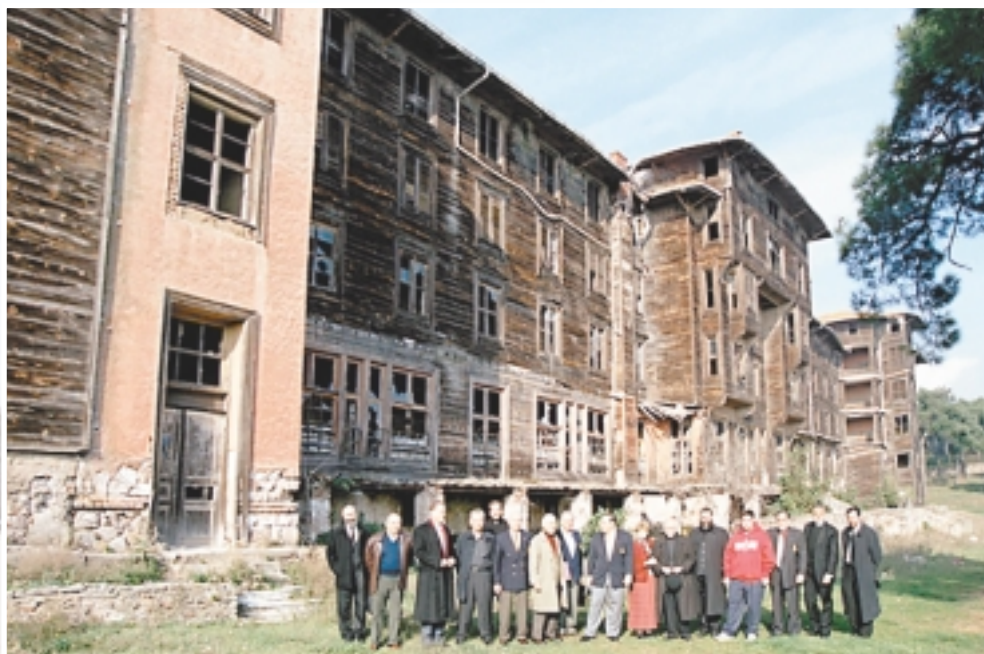
Pilgrims stand in front of the once-stately orphanage seized by the Turkish government.

A building whose corridors had echoed with children's voices now stands on the verge of collapse, its grand walls and staircases crumbling after decades of neglect.