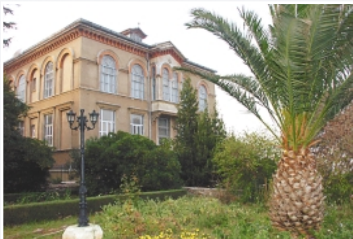
A side view of the Halki seminary, built on the site of a ninth-century monastery.