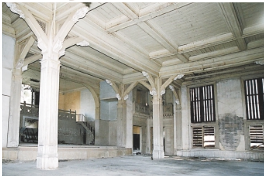
This grand hall served as an auditorium.