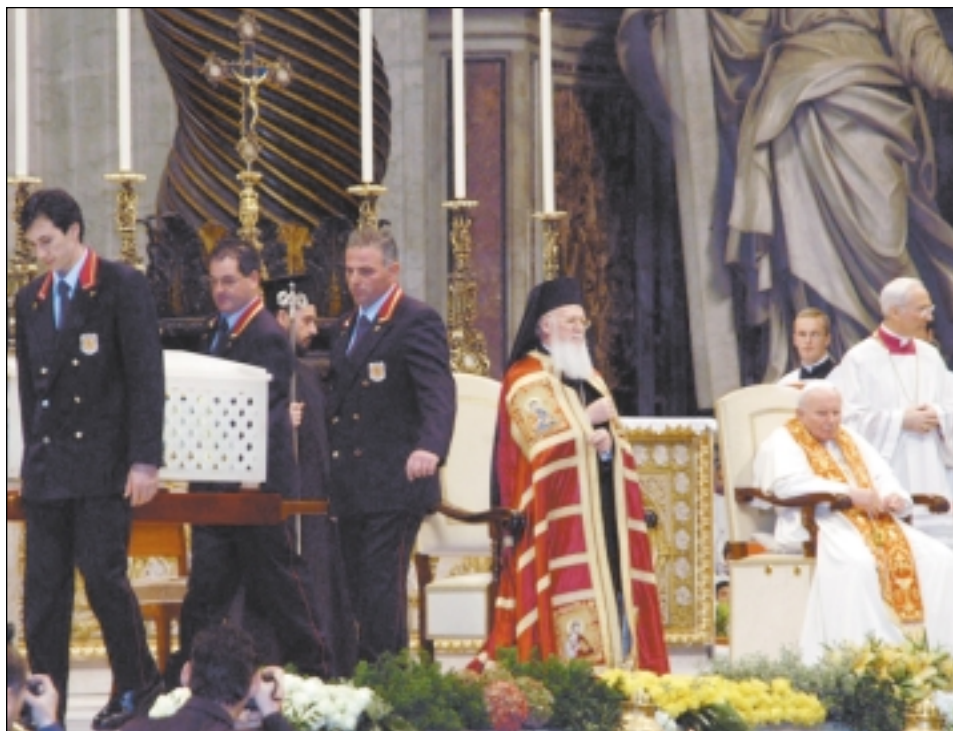
Ecumenical Patriarch Bartholomew and Pope John Paul II (seated, right) preside over transfer of relics of St. Gregory the Theologian and St. John Chrysostom at St. Peter's Basilica in Rome.

(See inside pages for articles relating to the pilgrimage).