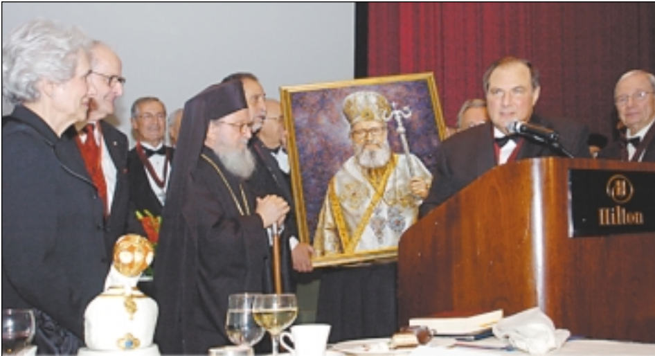
At the annual banquet, Archons present a mosaic portrait to Archbishop Demetrios commemorating his fifth anniversary as our archbishop.