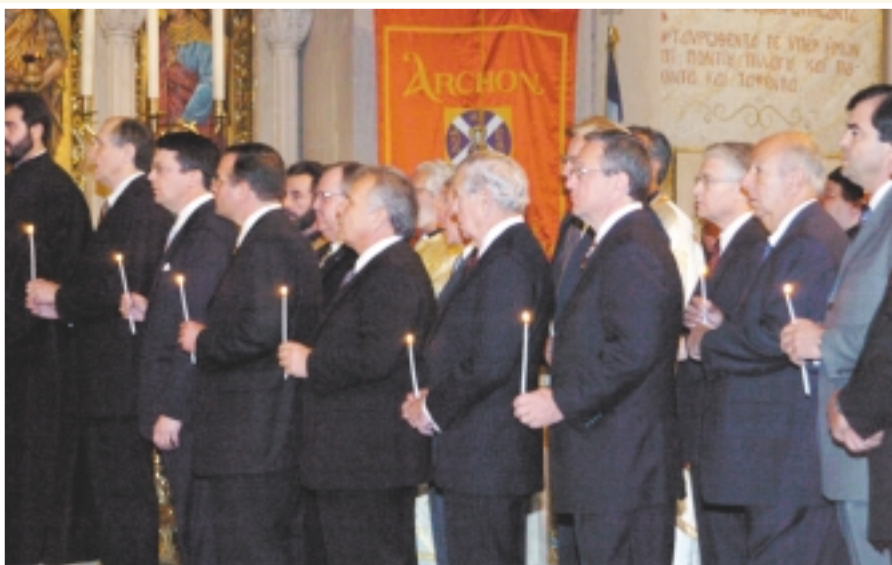
Archons of the Class of 2004 prepare for their investiture.