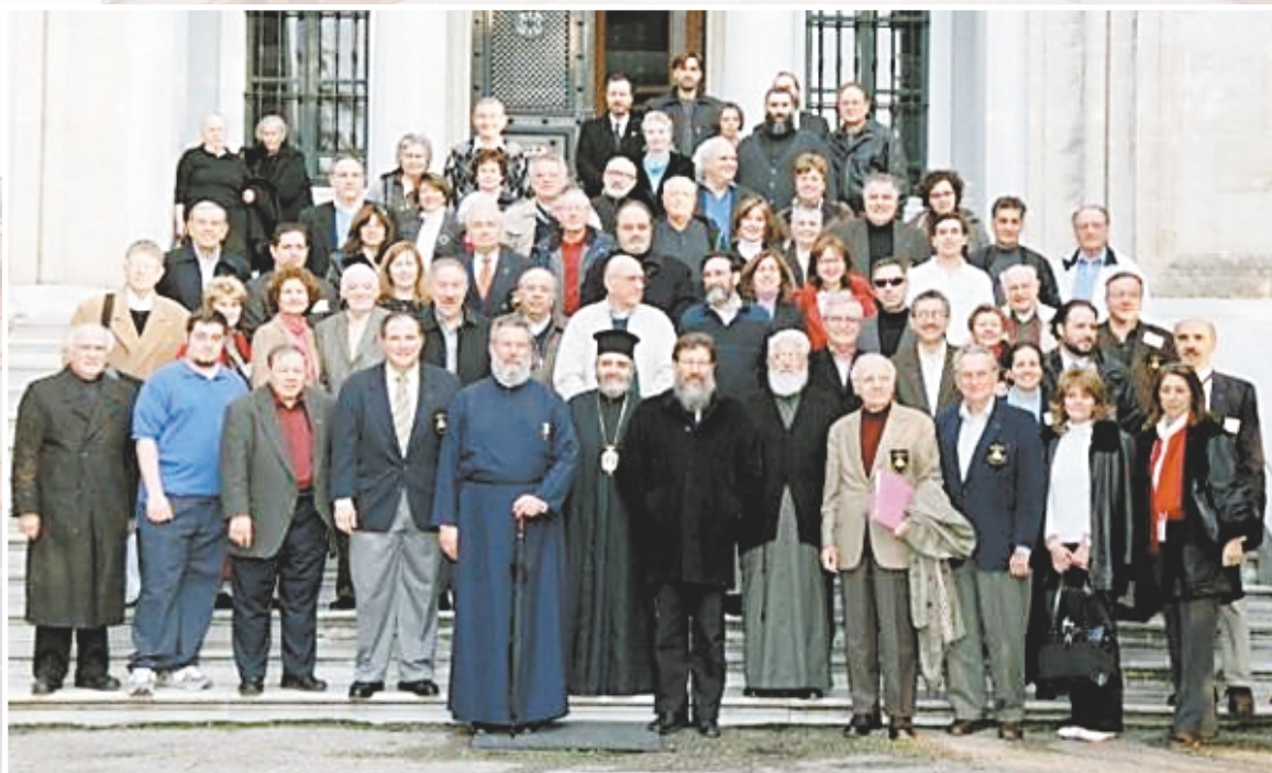
Archons, pilgrims, and officials of the monastery at Halki gather in front of the School of Theology that has been closed more than 30 years.