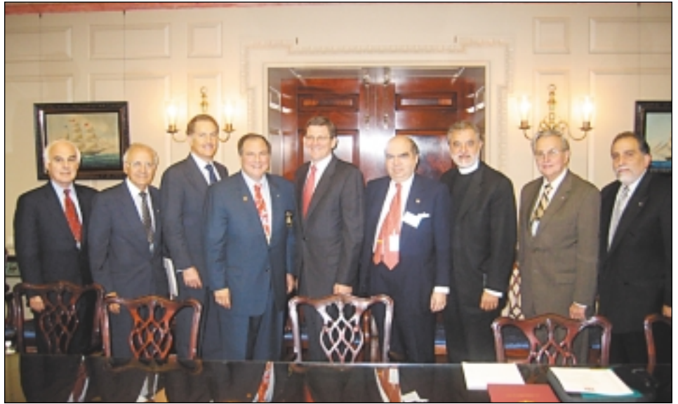
On Oct. 14, members of the Order traveled to Washington D.C. to brief Undersecretary of State Marc Grossman (center) on the state of religious freedom in Turkey.