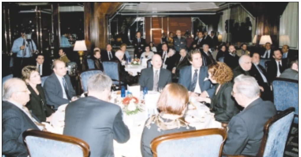
Banquet honoring U.S. Ambassador Eric Edelman.

We the Archons of the Ecumenical Patriarchate in America, salute Ambassador Eric Edelman for his service to the people of the United States, for his commitment to religious freedom and tolerance and for representing the very finest in what America offers to all peoples of the world: the unparalleled dedication and defense of life, liberty and the pursuit of happiness.