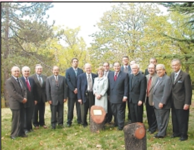
Archons at United States Embassy September 11th Orchard in Ankara