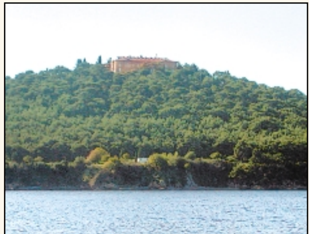
View of Theological School of Halki