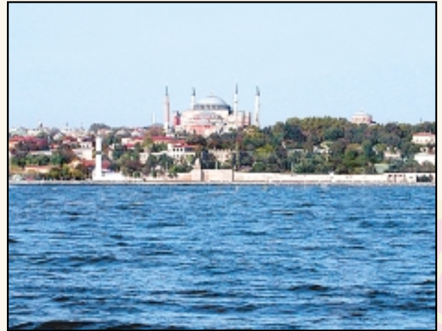
View of Hagia Sofia