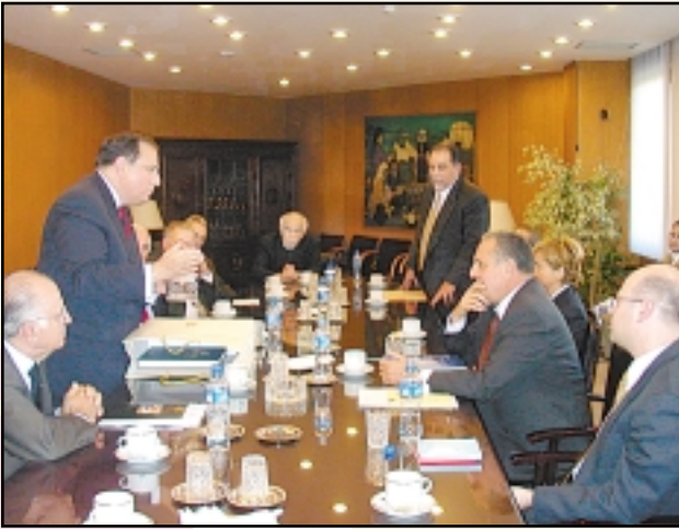
National Commander Limberakis leads Archon delegation at Turkish Foreign Ministry