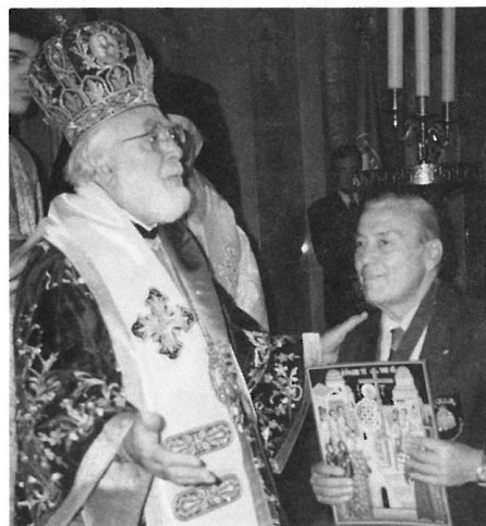
The Archbishop blesses recipient upon receiving Icon, during Sunday of Orthodox procession.