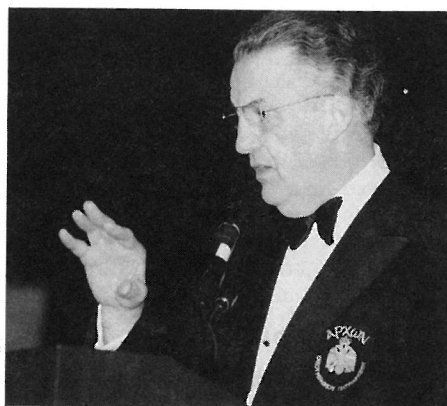
Senator Paul Sarbanes makes point during the Banquet.