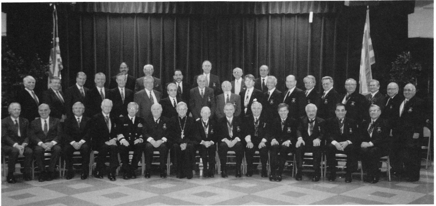
Class of '93 inductees pose with the National Council