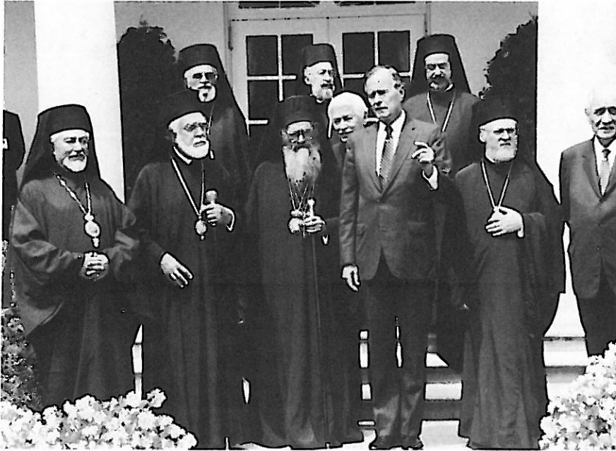
In July 1991, President Bush flanked by the late Patriarch and the future Patriarch Bartholomew I, and members of the Holy Synod of Constantinople, at the White House.