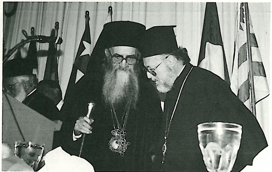
Newly installed Ecumenical Patriarch Bartholomew I conferring with his late predecessor Dimitrios I during their visit to the U.S. in 1990.