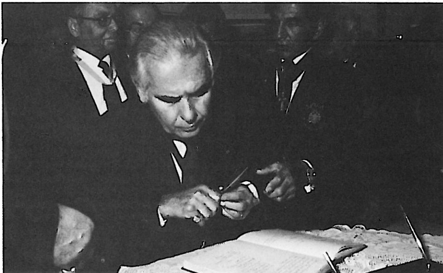
The National Commander signs the Register.

education at the Greek Schools of THERAPIA. At age 17, Dimitrios Papadopoulos entered the Theological School of Halki and in 1937 graduated with honors. Ordained a deacon in 1937, he was attached to the Metropolis of Edessa, Greece. He was ordained a priest in 1942 and served the Church in Greece, Turkey and Iran, prior to his election as Patriarch in 1972.