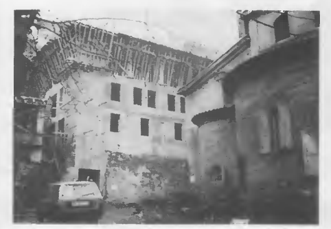
The Patriarchate — Initial construction