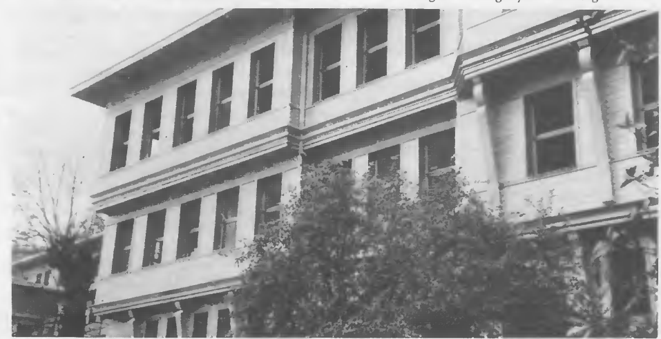
As completed to date in preparation for interior finishing