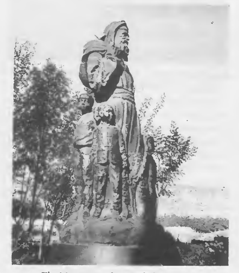
The Monument of St. Nicholas at Myra

basic human rights and religious freedom of all people, regardless of race, color or creed.